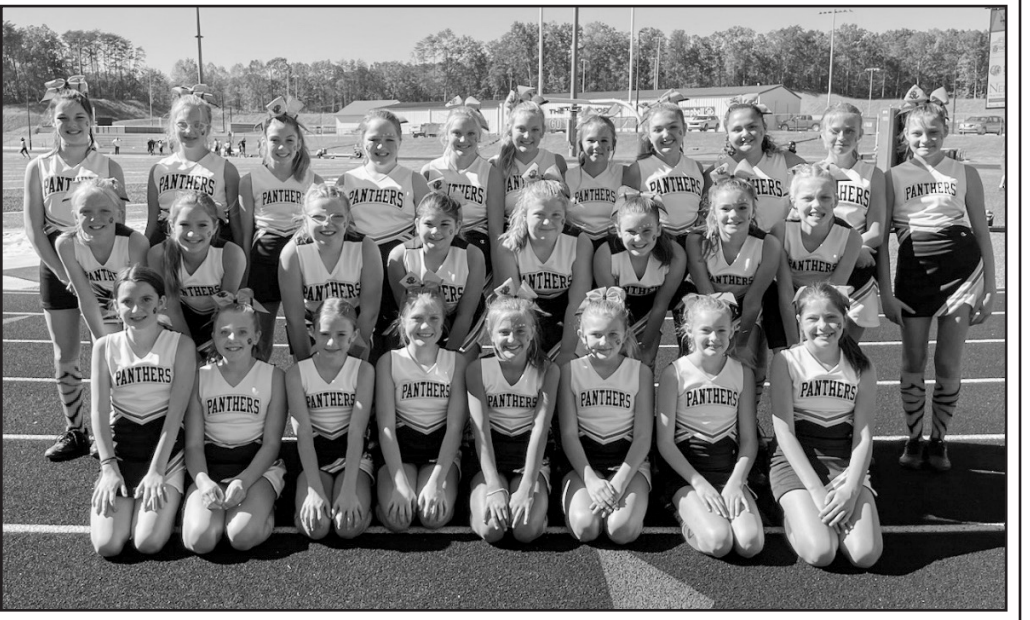
The 6th grade cheer team getting ready to support the Panthers at White County on Saturday. The following day, the girls collected their second Cheer Bowl title at Dawson County.